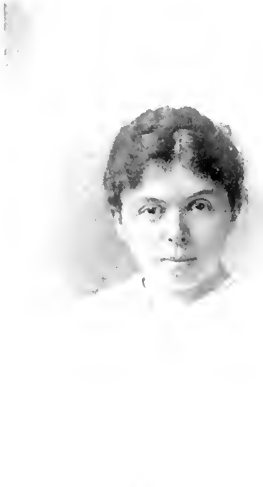
ALICE FREEMAN PALMER.

PALMER, Mrs. Alice Freeman , educator, born in Colesville, Broome county, N. Y., 21st